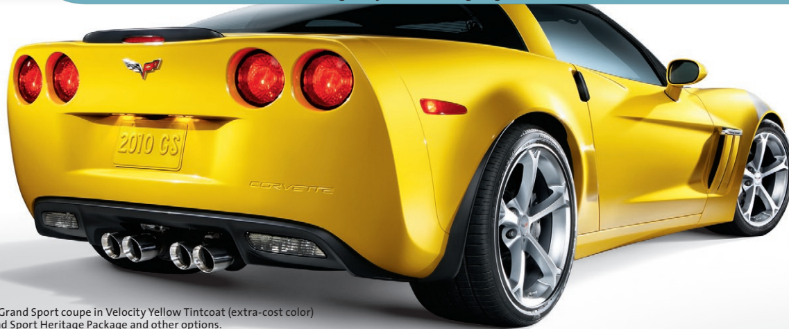
Corvette Grand Sport coupe in Velocity Yellow Tintcoat (extra-cost color) with Grand Sport Heritage Package and other options.

Corvette coupe, convertible, Z06 and ZR1 (very limited availability) have steadily grown in stature amid the world hierarchy of performance automobiles. Now, two NEW models join the stable for 2010 — Grand Sport coupe and convertible. Inspired by the iconic racing Sting Rays of the 1960s, the GS includes a wider track, aggressive dampers and springs, larger stabilizer bars, and much more. Corvette coupe, convertible and Grand Sport are all powered by a standard 6.2 Liter V8 engine that delivers 430 hp and offers an EPA estimated 26 MPG highway, all with no gas-guzzler tax.